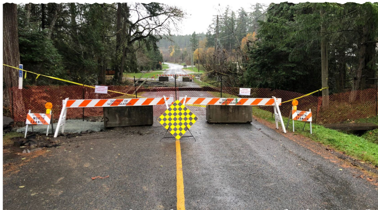
Chalet Road at Chalet Creek

These simple actions help manage the flow of water around properties to ensure drainage systems are working as they are designed.