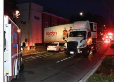
A driver is facing $1,200 after crashing into a tractor-trailer.

The driver was released with a Motor Vehicle Act ticket as well as an undertaking to appear in court at a later date.